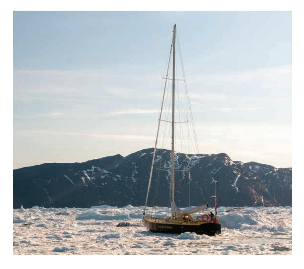
CHRONICLES OF THE CRUISING CLUB OF AMERICA